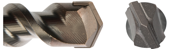
SDS Plus Cross Head