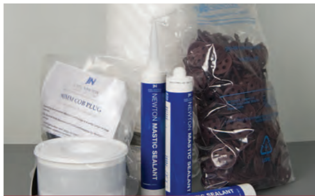
Full range of ancillary products available