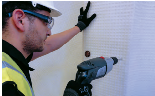
4 Drill and then fix with the fixing plug