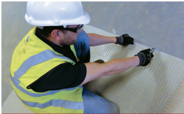
1 Cut the membrane to size