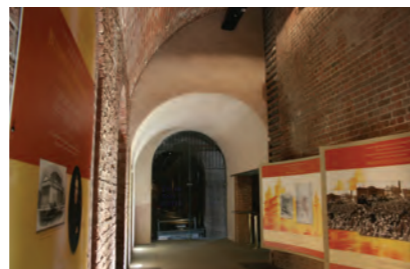
Newton damp proof membranes installed to the walls of St George's Hall, Liverpool, to fit the contours of the structure. The damp proof membrane acts as a permanent barrier and allows the damp walls to dry out