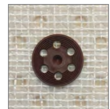
Newton damp proof membranes have a pattern of raised studs which create air channels to enable the damp wall to dry out

Newtons product range continues to grow to encompass products to deal with all aspects of commercial and domestic structural waterproofing, damp proofing and packaged sump and pump stations