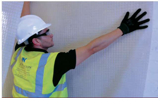
2 Place the membrane to the wall