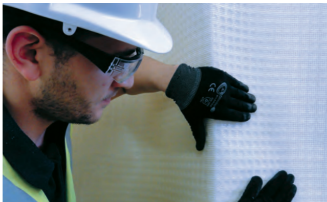
3 Neatly fold around corners