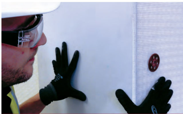
5 Apply wall finish