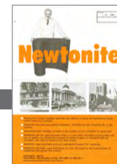
Newtonite brochure 1970's

Newtons damp proof membrane business flourished as UK housing stock was upgraded to habitable accommodation with Newtonite. During this period over 5 million metres of Newton membrane sold